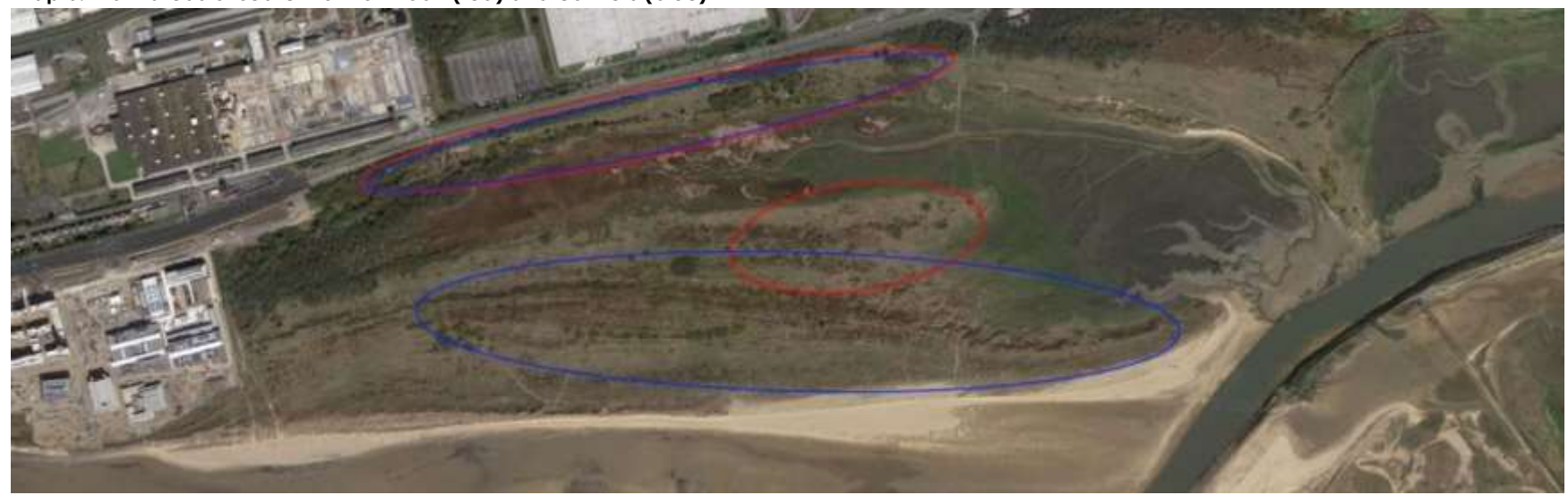
Map 6. Main areas of search for holm oak (red) and conifers (blue)

The NPT tree officer will be contacted prior to the clearance of any trees of significant size near the roadside (i.e. not if just scrub).