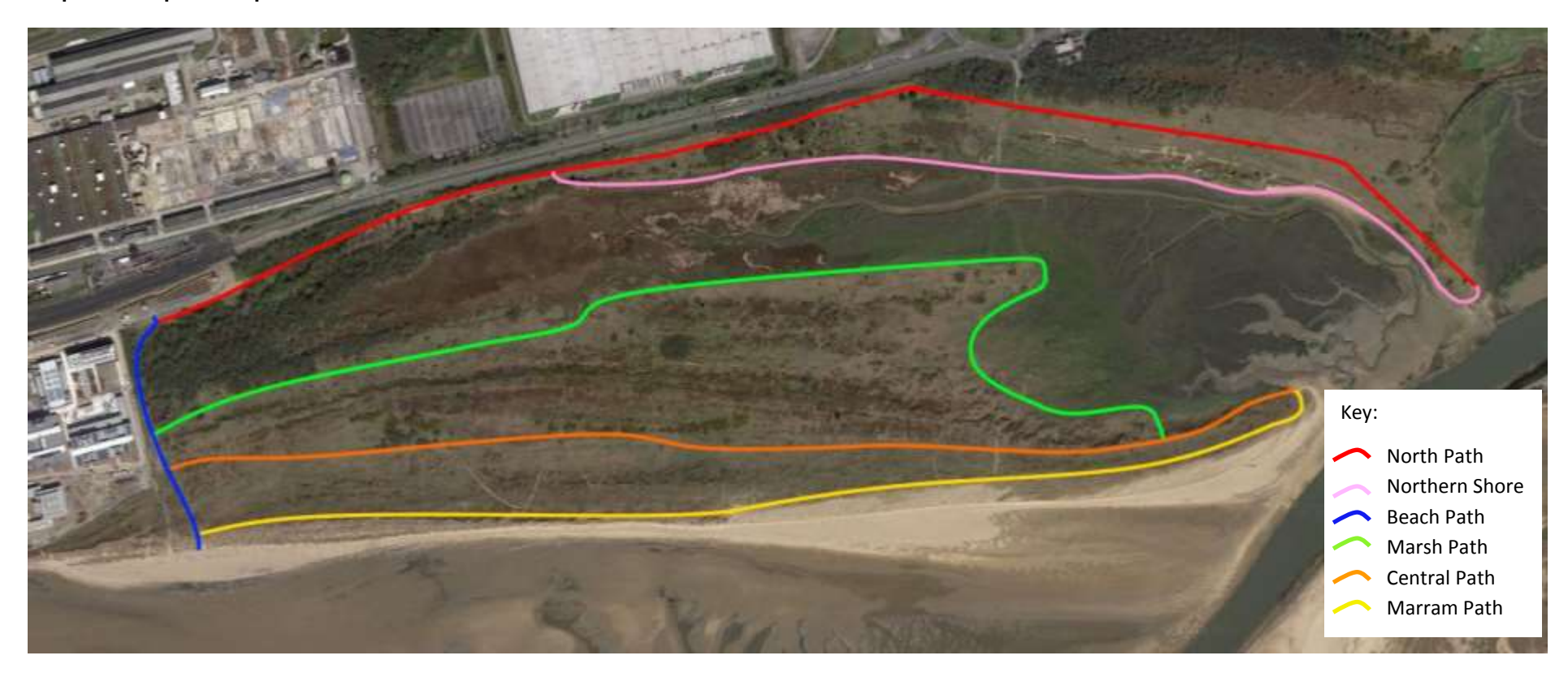
Map 8. Main paths to promote and maintain